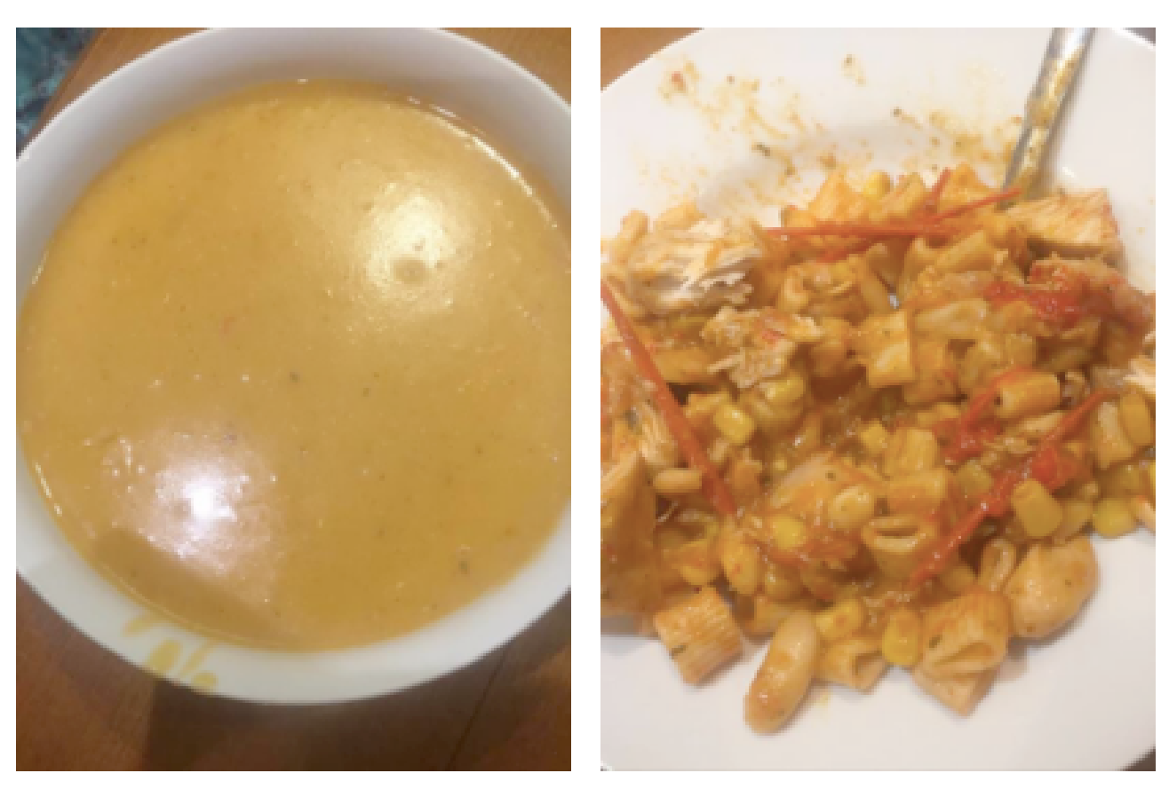
FIGURE 2. Nicola's Iftar (Nicola, Diary, Entry 1)