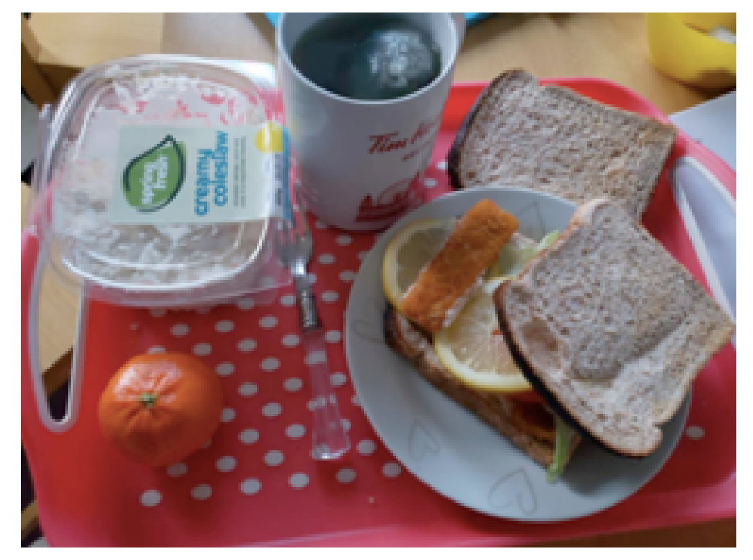
FIGURE 1. Mariya's Iftar (Mariya, Diary, Eentry 1)