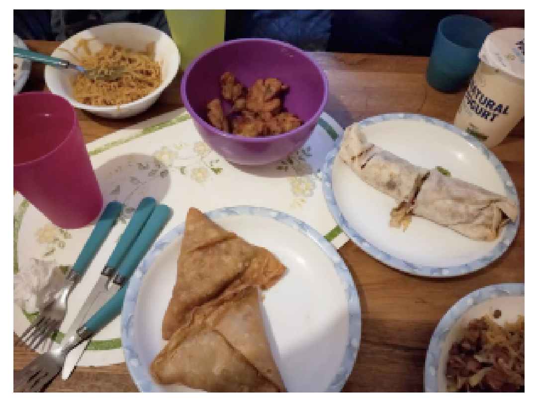
FIGURE 3. Syeda's Iftar (Syeda, Diary, Entry 28)